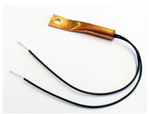
Figure 1.4.-1 SAS-10 Sensor

The function switch on the right side of the controller should be set in the center, 'AUTO', position for automatic pump control. When the switch is in the 'ON' position, Relay 1 will be on continuously, regardless of temperature difference. With the switch in the 'OFF' position, Relay 1 will remain off.