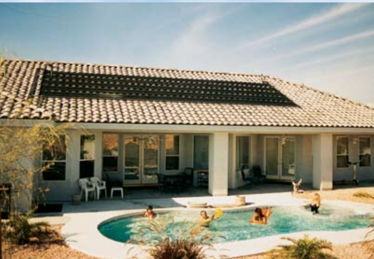
A one time installation provides decades of enjoyable, warm pool water.

Just think of the wonderful enjoyment that a warm pool will give your family and guests, not to mention the many health and fitness benefits of swimming regularly. Swimming is often called “the perfect exercise”.